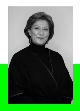
Director CLAUDIA TRIANA

Dedicated to the development of the Colombian film industry, Proimagenes Colombia was founded in 1998 as a non-profit corporation supported by the private and public sectors. Proimagenes manages the Film Development Fund (FDC) that awards yearly non-refundable grants to Colombian film projects in every stage of development and acts also as The National Film Commission, promoting the country as a filming location.